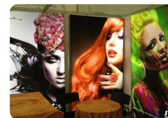
Light box advertising