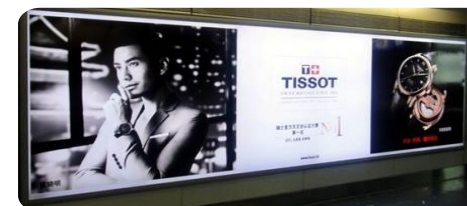
Light box advertising

Printer Dimension/Package Size: L7420mm×W1330mm×H1700mm L7620mm×W1480mm×H1720mm